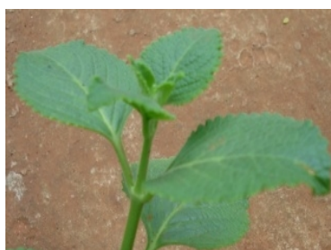
Figure 1: Plectranthus amboinicus

Zone of inhibition of mean ± SD in mm; (-) No zone of inhibition.